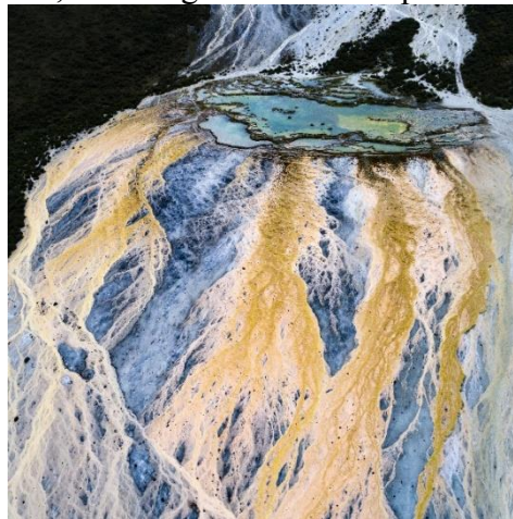
© Tugo Cheng, Hong Kong SAR, Open, Landscape and Nature

The Open competition is judged on the best single image, and spans 10 categories. The judges of the Sony World Photography Awards commended the images of four Hong Kong photographers in the Awards' Open competition, honoring them as the top 50 entries in their categories.