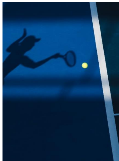
© Lamson Yip, Canadian, based in Hong Kong SAR, Open, Motion